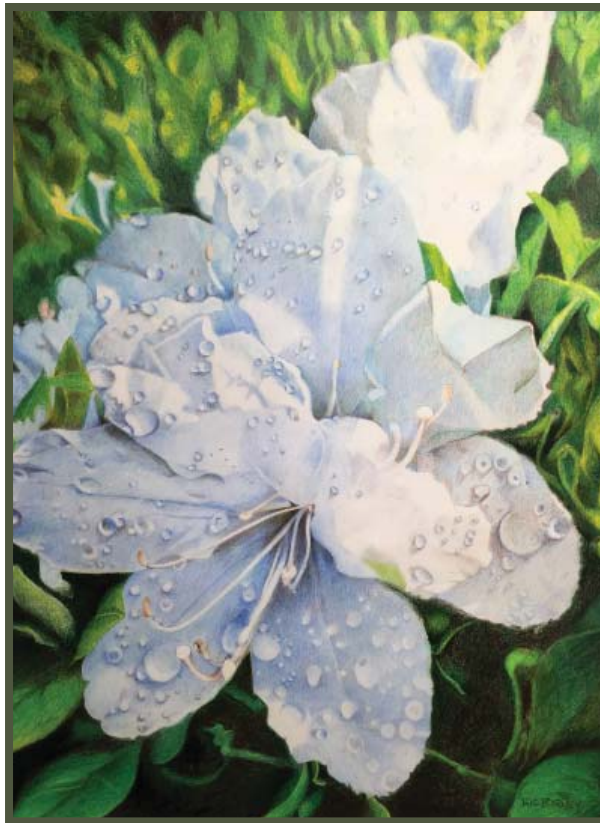
Morning Dew , Ric Forney